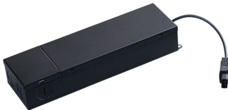
Hard Wired Power Supply 24V Constant Voltage with connector