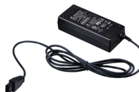
89814BK 24V 96W Plug-In Driver Non Dimmable