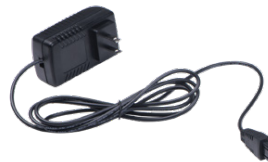
89811BK 24V 24W Plug-In Driver Non-dimmable